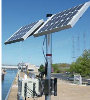
Real-Time Monitoring System on USACE Kentucky Lock

supporting both facility owners and the communities in which they operate with knowledge for the development of related crisis communications strategies, operations plans, training and exercises, response and recovery protocols, and other critical support systems.