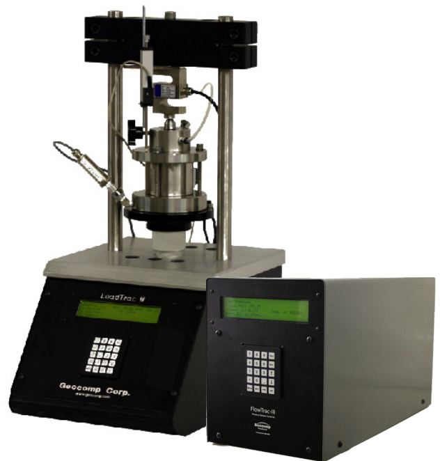
Standard Constant Rate of Strain (CRS) Consolidation System