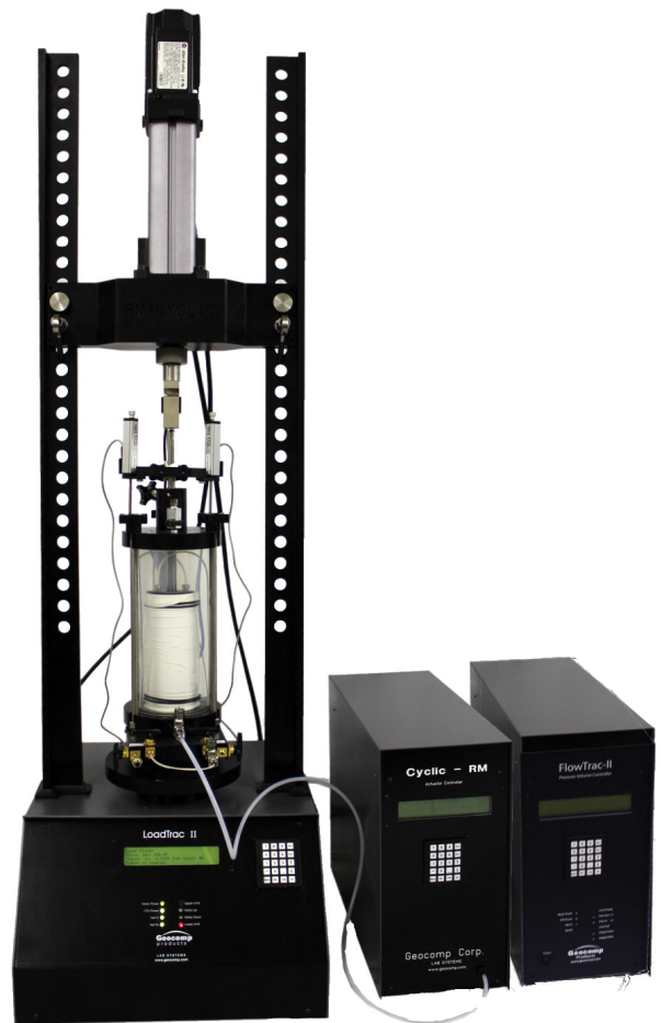
Standard Cyclic Triaxial LoadTrac II / FlowTrac II